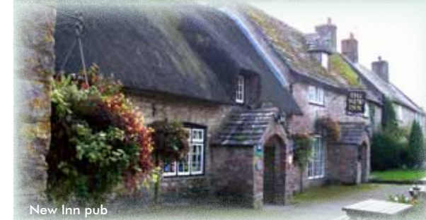
New Inn pub