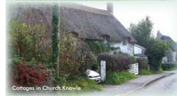
Cottages in Church Knowle