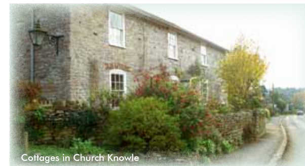
Cottages in Church Knowle