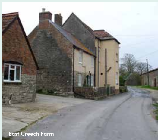
East Creech Farm

The hamlet of East Creech contains a small collection of historic agricultural buildings and cottages whose construction is characterised by use of a mixture of materials including locally produced brick, cob, stone and thatch. The landscape setting is particularly important, and most notably includes Creech Barrow Hill, a landmark across much of the District.