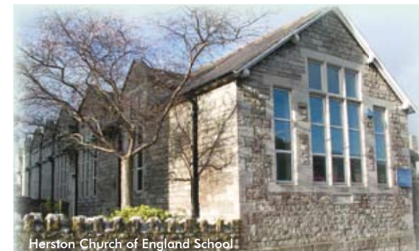
Herston Church of England School

The Character Appraisal document is available for reference at Swanage Library, the District Council offices and may be downloaded from our website: www.purbeck-dc.gov.uk