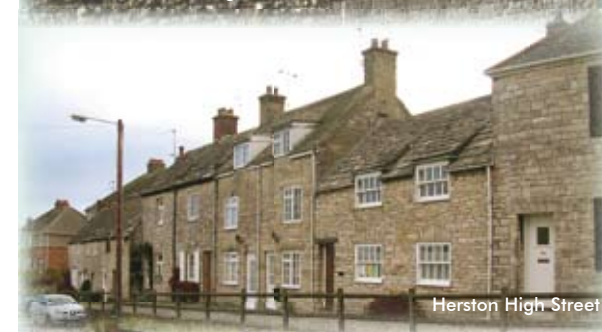
Herston High Street