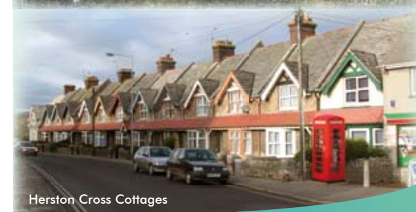
Herston Cross Cottages

Planning Services, Purbeck District Council, Westport House, Worgret Road, Wareham, Dorset, BH20 4PP. Tel: 01929 556561 Web: www.purbeck.gov.uk