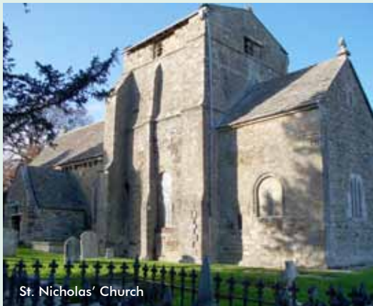
St. Nicholas' Church

The conservation area includes the historic core of the village with its network of lanes, open spaces and loose pattern of development.