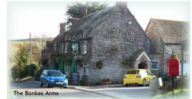
The Bankes Arms