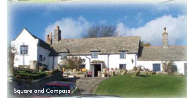
Square and Compass