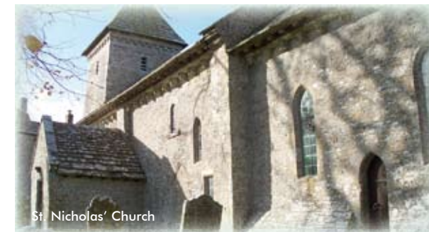
St. Nicholas' Church

The adopted Character Appraisal document for Worth Matravers Conservation Area (2009) represents an essential point of reference for those considering making an alteration to properties or land located within and around its boundaries. The purpose of the appraisal is: 1. to provide an in depth analysis of character which will inform both planning and development management at the Local Authority, 2. to assist property owners and their agents in the formulation of sensitive development proposals, 3. to assist property owners and their agents in execution of sensitive alterations allowed under permitted development rights, and 4. to identify potential for enhancement works within the Conservation Area. The Character Appraisal document is available for reference at Swanage Library, the District Council offices and may be downloaded from our website: www.purbeck-dc.gov.uk