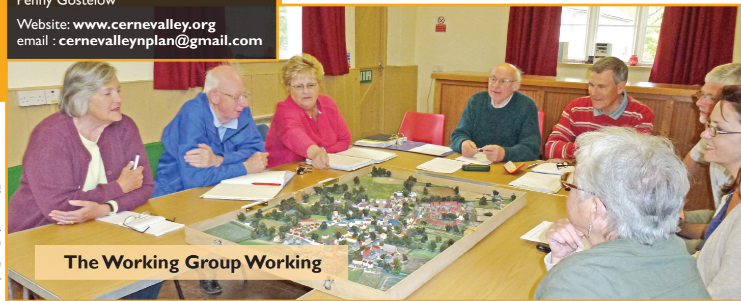
The Working Group Working