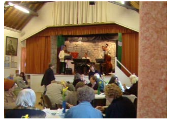
'We'll Fat Again' - Motcombe