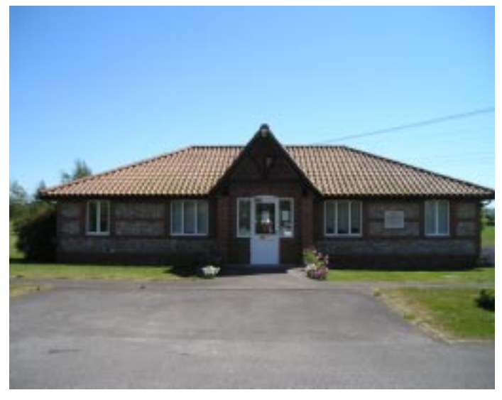
Fontmell Magna Surgery