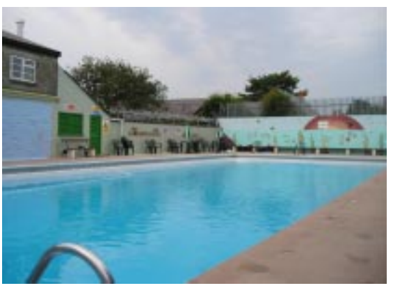
Shaftesbury Swimming Pool

While Shaftesbury has many areas of attractive and accessible open spaces, opportunities for more formal recreational activities are limited and provision for teenagers, both formal and informal, is particularly limited. In addition, the lack or inconsistency of public transport makes it difficult or impos-