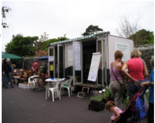
Gold Hill Fair 2005

All the documents and reports that form the evidence base of the CSP are available for inspection at the Task Force offices, Longmead, Shaftesbury.