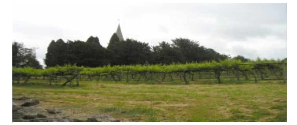
Fonthill Gif ford Vineyard

Concerns were expressed throughout the consultation process about the future of farming in the area. Nearly 6% of the local workforce is in agriculture and the Action Plan supports the principle that the industry has a continuing role to play in maintaining the countryside on which much of the area's appeal and tourism economy relies.