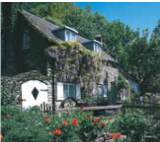
Corfe Castle Village The Blue Pool Cottage at Corfe