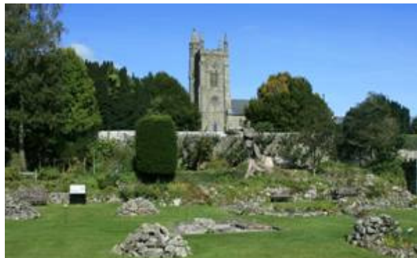
Figure 12: Holy Trinity Church with the ruins of the 12 th century abbey church in the foreground .

11. St James Suburb. The suburb of St James