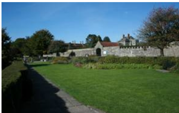
Figure 10: The entrance to the Abbey Museum.

1. The Burh . The late 9 th century burh lies along the Greensand ridge upon which the Saxon town and abbey were founded. It comprises a central axial street, Bimport, probably with regular burgage plots arranged along either side of it to the north and south. Bimport may have been