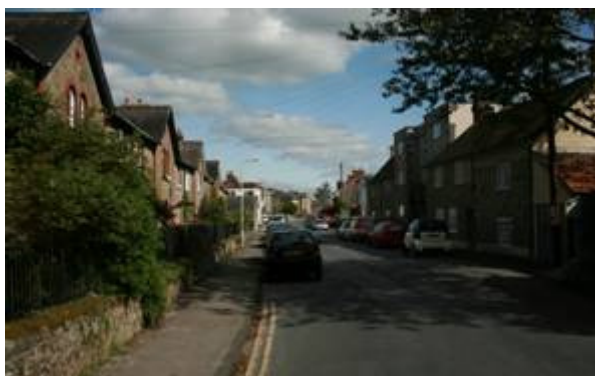
Figure 9: The eastern end of Bimport, possible site of the Late Saxon market.

Archaeological evidence suggests that that town was already expanding east of the abbey in the 10 th –11 th centuries (Bellamy 2003b; Heaton 2003; Keen 1977). The form and extent of this extra-mural settlement is not known but perhaps is suggested by the locations of the medieval churches along the High Street and