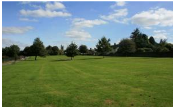
Figure 7: The northern side of the Saxon burh.