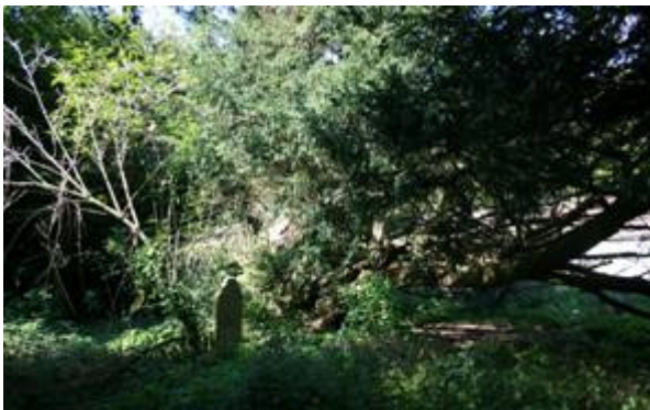
Figure 11: St John's Churchyard .

6. St Laurence's Church. This church was first