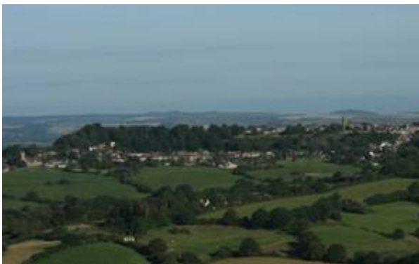
Figure 6: View of the Saxon hilltop town.

Shaftesbury is listed in the Burghal Hidage and is likely to have been one of the new fortified places created by Alfred in the period 878-879 (Haslam 2005). Shaftesbury is listed as having 700 hides, which translates as a wall length of 2887 ft (880m) or 700 men required to defend the fortification. William of Malmesbury writing in about 1125 mentions the discovery of an inscribed stone from Shaftesbury which states that Shaftesbury was founded in AD880, the eighth year of the reign of King Alfred (RCHME 1972, 57). The stone may not be contemporary but it does attest to a belief locally that the burh was founded in AD880 (Keynes 1999, 38), which accords well with the date proposed by Haslam (2005).