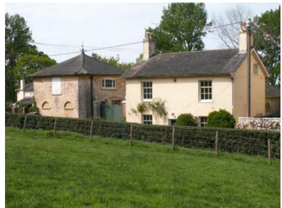
Glendon Cottage & Coach House

Situated to the south of 'Glendon' is a two-storey cottage. This, too, has rendered walls and a formal front elevation, simply fenestrated with four symmetrically placed three-over-six sliding sash windows around a six-panelled central door. The gabled roof features two tall chimney stacks, one at each end of the ridge. The roof itself is clad in its original slates. The cottage faces directly onto the road, behind a short frontage enclosed by iron railings.