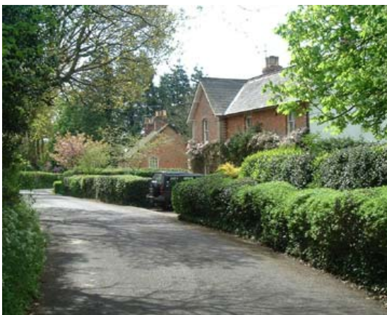
Victoria House, Sleight Lane

The hedges reinforce the rural character of the conservation area. Even non-native species make a significant contribution to defining the character of the road, such as the lower part of Sleight Lane near Victoria House and Victoria Cottages.