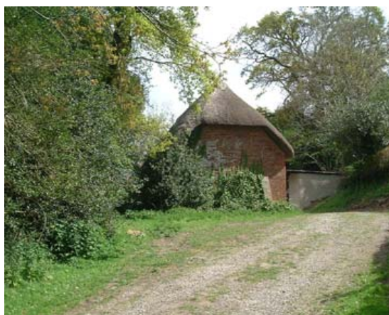
Cob barn, east of Glendon

Up the hill from Hart's Cottage, accessed by a short track in front of Glendon is another vernacular building within the conservation area, a small barn constructed of cob under a thatched roof. The barn is in a good state of preservation. Its form and materials contributes significantly to the character of the conservation area. The barn is deemed to be listed, as at the time of listing it formed part of the historic curtilage of 'Glendon'.