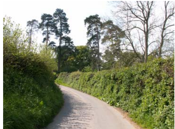
Approach from north

Oaks continue down Brog Street to the conservation area boundary. Here to the west is a distinctive line of five scots pine that follows the property and conservation area boundary.