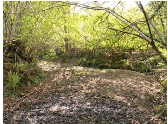
Track south of Harts Cottage

cottage. Opposite the Cottage is a small thicket with a coppiced hazel-lined field access cut deep into the ground adjacent.