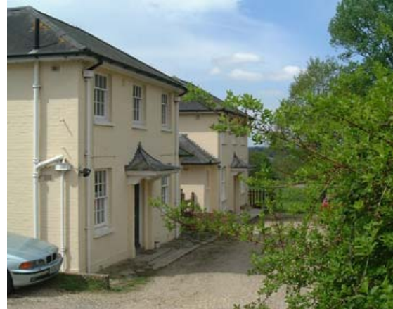
Rose House & Field House

distinctive central doorways, having sweeping profile lead hoods supported by scroll brackets. The symmetrical pair forms a prominent feature when viewed from the triangular green. As these houses were built by and for the owners of Glendon and formed part of the historic curtilage at the time of listing they are now deemed to be listed.