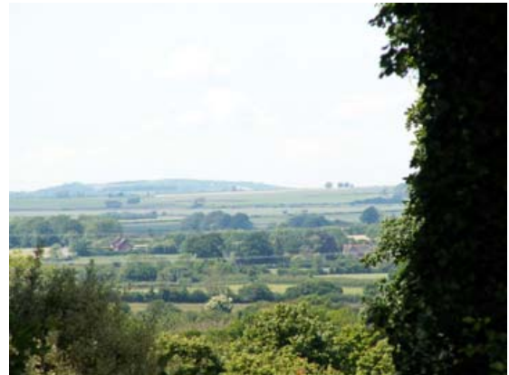
View to Badbury Rings to north-west

The introspective character of Brog Street and Sleight Lane is interrupted by occasional long-distance views. There is a panoramic view from the green to Henbury Park to the west. From the green there is also a narrow long-distance view, framed by trees and Rose House, to Badbury Rings to the north-west. Henry Lamb's painting shows the fuller view before it was obscured by trees.