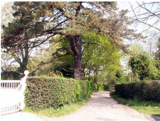
Brog Street, Glendon on left

Hedges are vitally important landscape features which enclose the roadside in a soft and informal way. They provide fairly continuous boundary treatments that unify the conservation area. The upper part of Sleight Lane and Brog Street north of Glendon are characterised by high hedge banks. Most of the hedges are of mixed rural species, but in the vicinity of Glendon the hedges are of clipped holly.