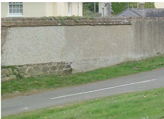
Wall south of Rose House

The conservation area features a wide range of traditional materials, relating to the period of construction. The earliest vernacular buildings are built of local clay cob under thatched roofs. Some walls are rendered but others are faced in brick. Chimneys are in brick. The high cob wall on the west side of the triangle, which once formed part of a range of thatched barns, has green sandstone rubble footings. The wall is now capped with tile and ridge tile capping.