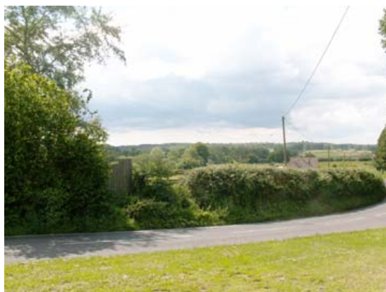
View to south-west from the green

The only public open space is the small, sloping triangular green, eulogized in Henry Lamb's watercolour painting of 1926.