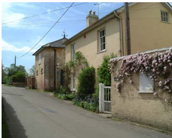
Glendon Cottage & Coach-house

The Policy and Resources Committee of East Dorset District Council, at its meeting on 31 October 2007, approved the designation of the Brog Street, Sleight Lane Conservation Area, Corfe Mullen.