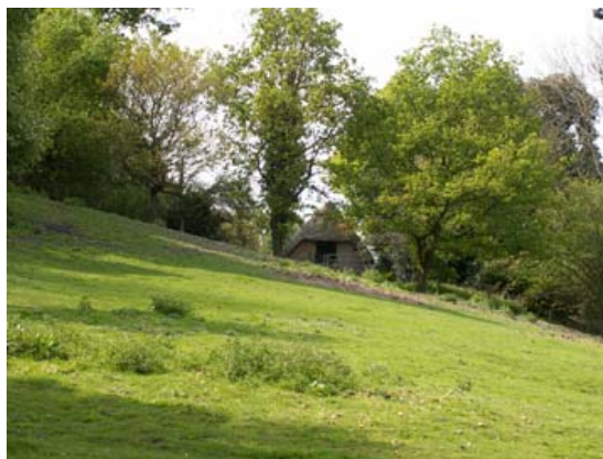
Paddock south of Harts Cottage

Green spaces, comprising gardens and paddocks, articulate the individual buildings and building groups and allow the countryside to permeate the character of the conservation area. Green spaces also form a transitional area between buildings and open farmland.