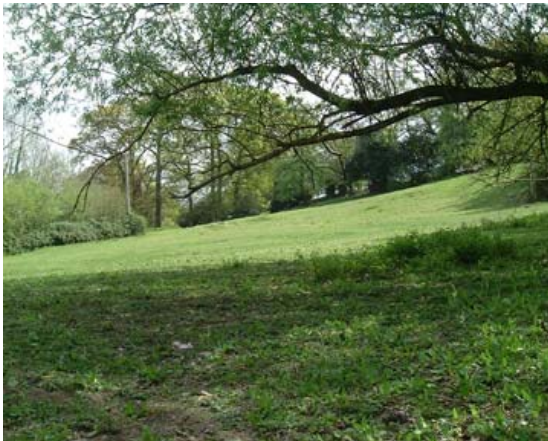
Paddock east of Glendon

Belts of oak and ash form important and effective landscape edges that separate the conservation area from adjacent suburban housing. These occur on the south side of Blandford Road east of the junction with Sleight Lane; and at the rear of properties in Rectory Avenue where they adjoin fields once belonging to the Glendon estate. The latter are protected by a Tree Preservation Order. A second belt of trees runs more or less parallel lower down the hillside, enclosing the old cob barn, and continues as an oak copse to Brog Street.