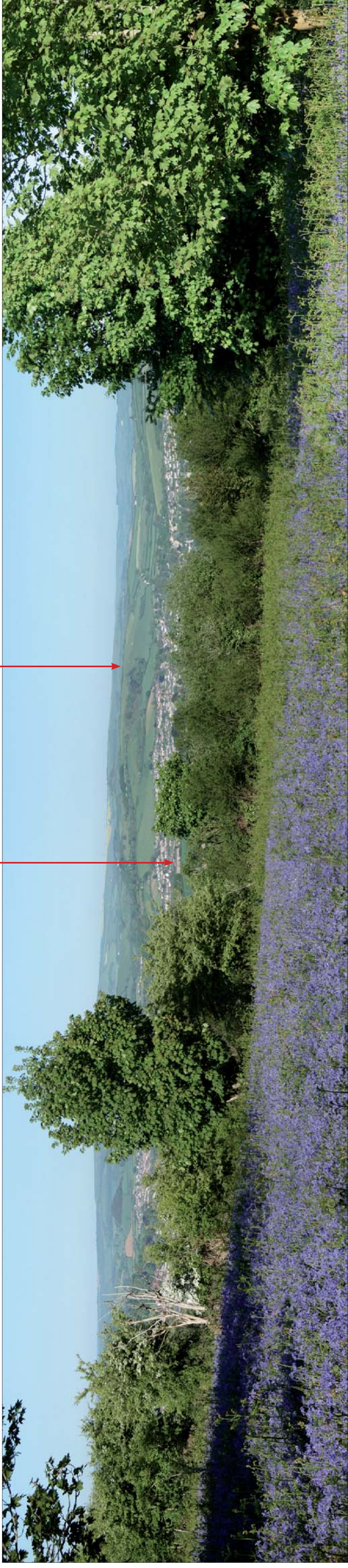
View 7: View from a public footpath on Eype Down where vegetation obscures the site from view. There are views across Bridport and the Powerstock Hills to the east.