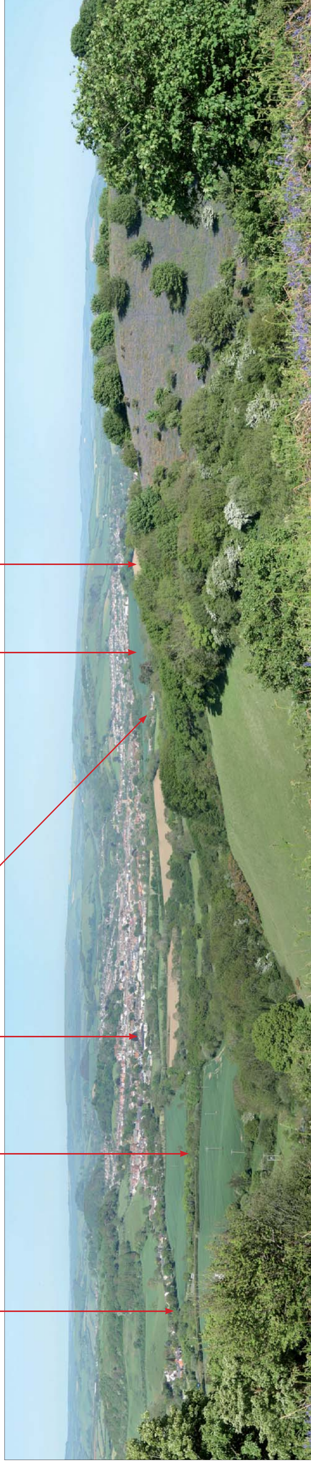
View 8: View from Open Access Land on Eype Down. The eastern parts of the site are partially obscured by vegetation along field boundaries. The western parts of the site are more open in character, but retain a strong structure of boundary vegetation.

NB: All views consist of one or more photographs taken with a Canon EOS 400 digital camera with the lens set to 50mm, forming a panorama. No dimensions are to be scaled from this drawing. All dimensions to be checked on site. Area measurements for indicative purposes only.