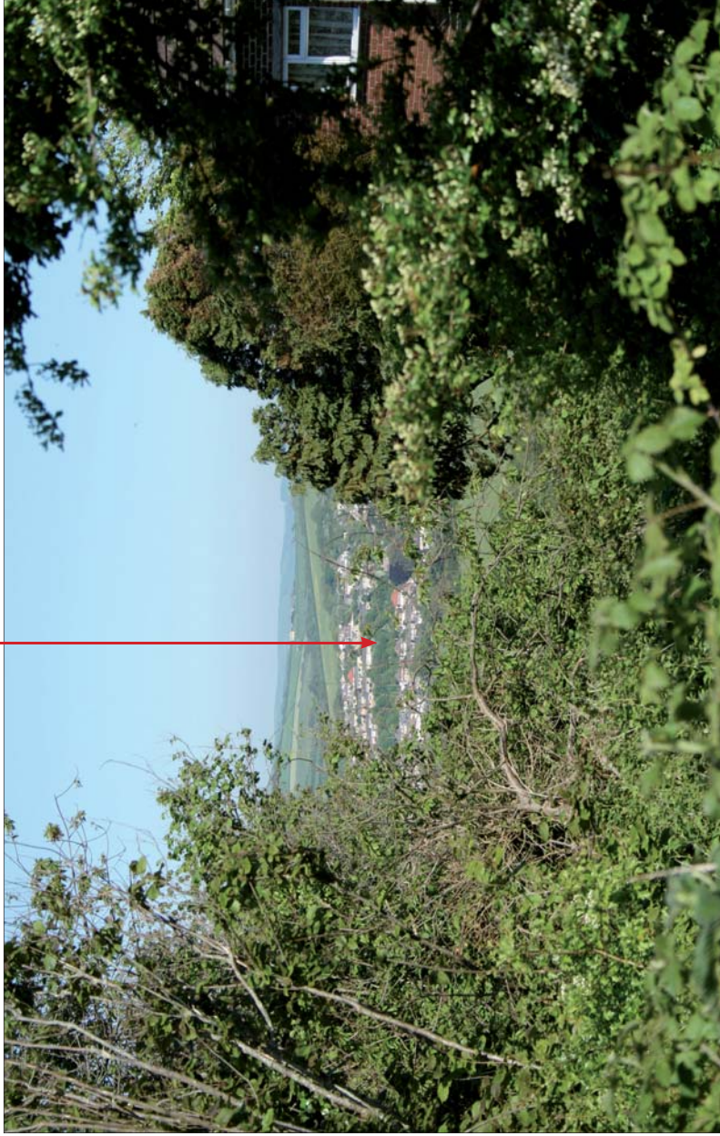
View 5: Glimpsed view from the public footpath north of Eype Centre for the Arts (formerly St Peter's Church), looking northeast. Most of the site is obscured from view.